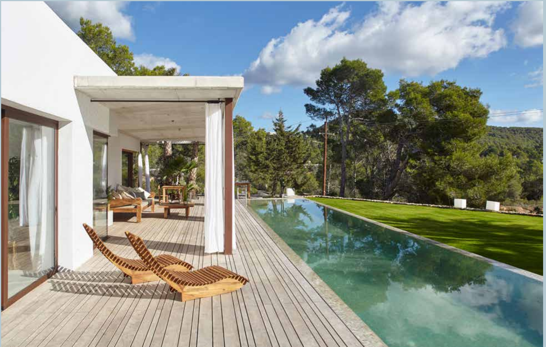
Villa Matisse, San José € 3.200.000